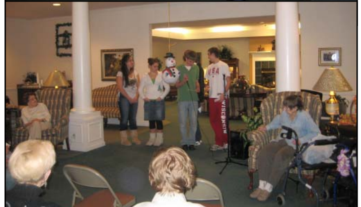
Spanish students from Appleton North High School visited with Touchmark residents and performed a Spanish alphabet “rap.” Students also shared some Spanish vocabulary and a brief history of the piñata. Then the residents took turns trying to break the snowman piñata. (cont.)