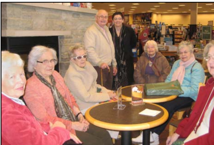
The Touchmark Book Club traveled to the local Barnes & Noble for some holiday shopping. The trip was topped off with coffee and a sweet treat at Starbucks.